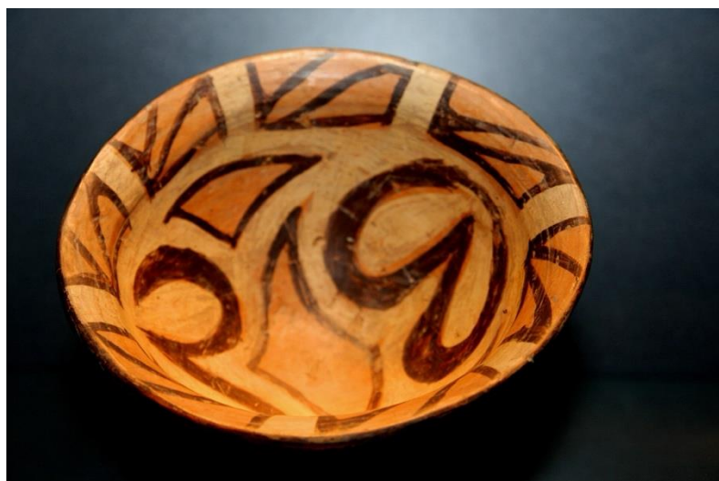
Decorated Nebelivka pottery.

Again, these people favoured women in their art and culture. Many female clay figurines survive; some of the art on the pottery depicts women. Each of the homes was similar in size and content to its neighbours, yet each had its own variation of multi-coloured tools and household items.