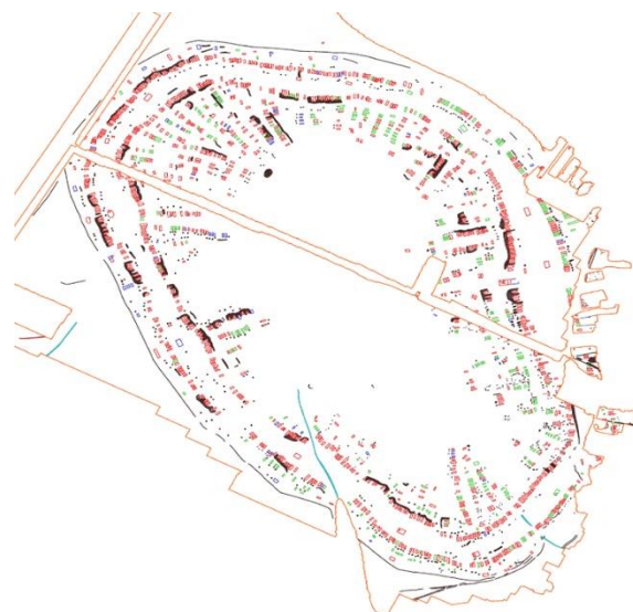
Layout of Nebelivka

From about 4,100 to 3,300 BCE several early cities – dozens – existed in what is now (unless conquered by Russia) Ukraine and Moldova, grouped together just seven-to-ten kilometres apart. The largest discovered so far, Taljanky, covered over 300 hectares. For eight hundred years, the inhabitants of these cities did without a ruling elite, to judge by the fact that in contrast to ancient cities with rulers, there were no palaces, no walled fortifications, not even central administrative buildings or stores. Mostly, the settlements consist of hundreds of houses, arranged in great rings with spaces between each ring.