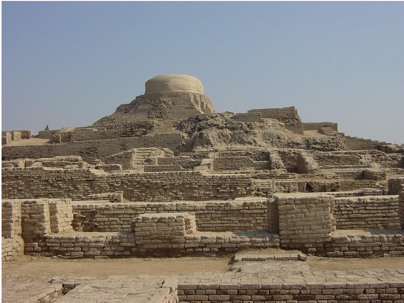
Mohenjo-Daro

Some residents seem to have had routines that included daily bathing. Beyond them, wealthy merchants had homes. Some kind of social division seems to have existed. But the wealth distribution suggests that it wasn't one that allowed a small elite to command others.