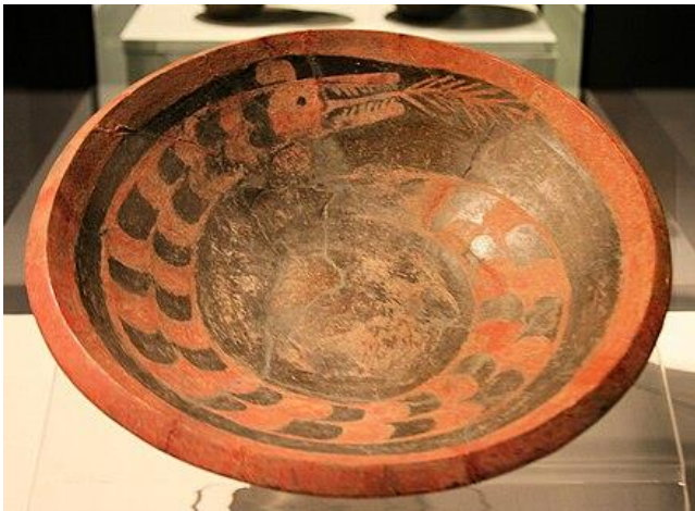
Dragon bowl

And Taosi put on a spurt of growth. This looks like the first evidence for a popular revolution of commoners against their elites. And the likelihood of this being the case is reinforced by how the elite cemetery was suddenly used for commoner graves as well as a mass burial at the palace, with bodies of people which had suffered grotesque violations. Whatever the exact story, Taosi testifies to the fact that people living in ancient cities could dramatically re-organise themselves. Probably, this happened a lot and it might well have happened peacefully in some cases, so that we don't get the same archaeological evidence for an outburst of violence.